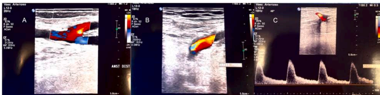
Fig. 4. Two years follow-up DUS exam. Patency of the extra-anatomical bypasses (A, B) and of the in-situ bypass (C).