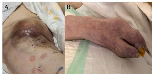
Fig. 2. Patient' clinical presentation with recurrent right groin hematoma (A) compressing the in-situ vein bypass and determining poikilothermic, painful, cyanotic, and pale right limb (B).

In January 2020, the patient self-presented to our emergency department, for the first time, with knee pain, current fever, and weakness. At the nasopharyngeal swab he tested positive for SARS-CoV2. He was admitted with the diagnosis of right knee septic arthritis. Blood cultures were obtained, and he was transferred to the internal medicine department to start broad-spectrum antibiotic therapy. Subsequent blood cultures revealed Methicillin-Resistant Staphylococcus Aureus (MRSA), and targeted antibiotic therapy was immediately started. After nine days of treatment, blood cultures were repeated and turned negative. A CT angiography (CTA) ruled out knee and body district colonization, showing right knee joint effusion, with no sign of VGI.