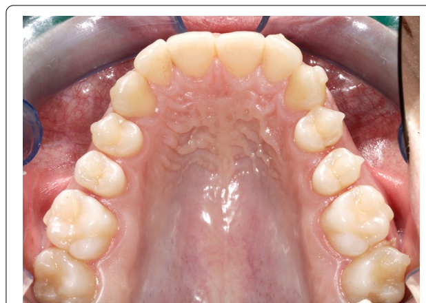
Fig. 2 Treatment protocol with Clear aligners