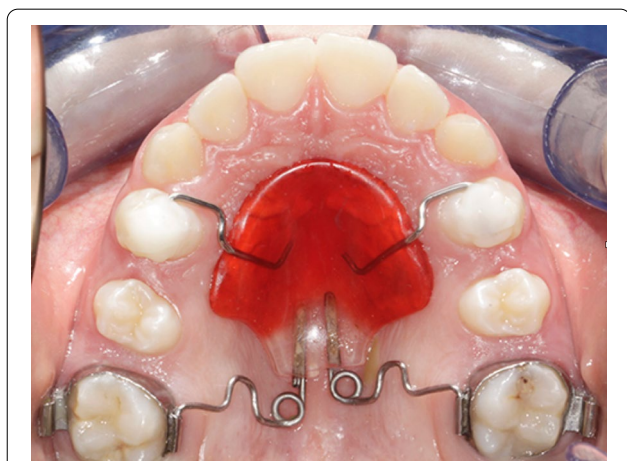
Fig. 1 Treatment protocol with Pendulum appliance