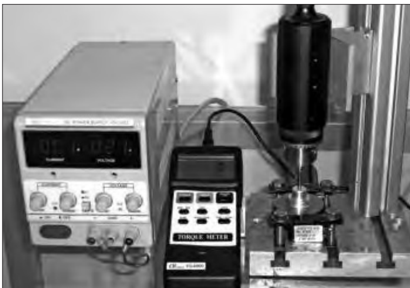
Fig 4 The measurement device with aluminum implant holder and the coaxial holder of the screw-driver joined to the torque meter and the electric engine.