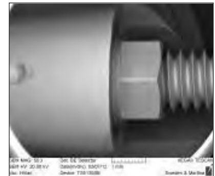
Fig 2 Scanning electron microscopy (SEM) images of abutment/screw complex after steam cleaning; ( left ) lateral and ( right ) apical views (original magnification \times 50 ).