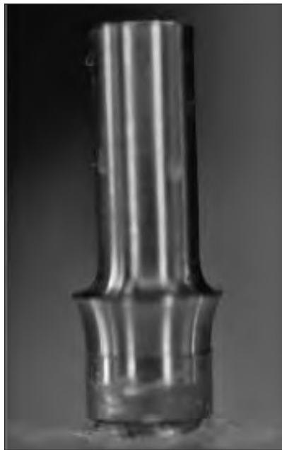
Fig 1 The titanium abutments ( left ) before and ( right ) after customization by means of carbide burs (coarse and fine) followed by steam cleaning.